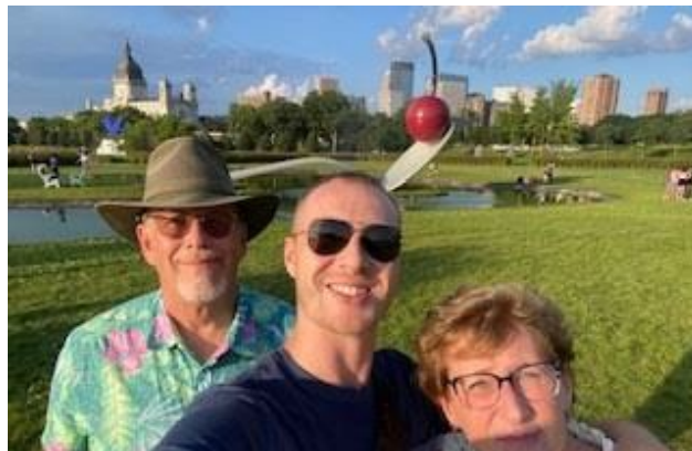
Photo proving cherry balancing does run in the Barth family...