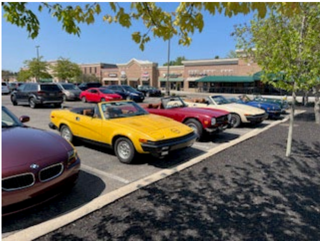
Meeting up in Centerville for the first leg