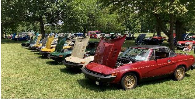
You can never have too many Wedges...