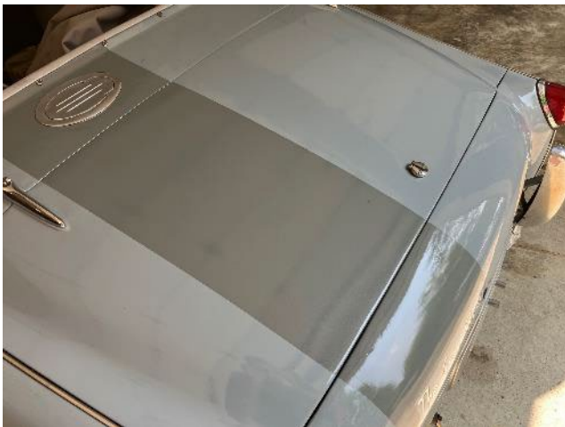
Rear stripe on TGG