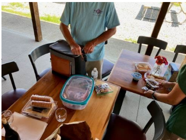
Prepping to eat like kings...

The winery wasn't very busy (yet) and we scored a nice outside table, in the breeze, but not in the sun. Speaking of sun, did I mention no clouds in the sky? Everyone brought out, or bought vittles and we ate like Kings!