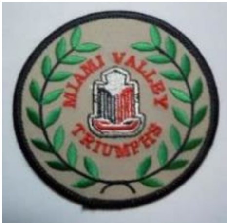
MVT Cloth Patch - $12.00