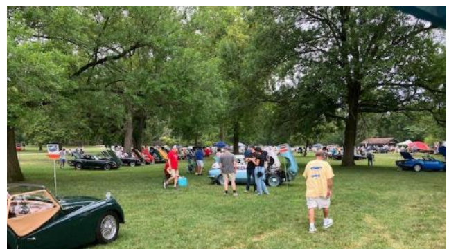
By 11am the show field was starting to really look like a show field!