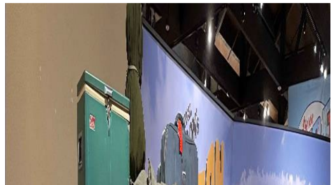
Not a TR, but a famous car nonetheless...

We got some ice cream and then retreated to one of the seven museum buildings to ogle automotive art on wheels. It was hard to absorb so much polished chrome and nuances in designs. The back stories on where the cars were found and/or restored were equally fascinating. We were greeted at the main building with a room full of 70's and 80's "woodies" leading off with the Ford LTD station wagon from National Lampoon's Vacation movie of 1984, displayed as it was after it's encounters with various the fences etc. in the film. Several hours later we drove back to Kalamazoo to the hotel and had a good Italian dinner.