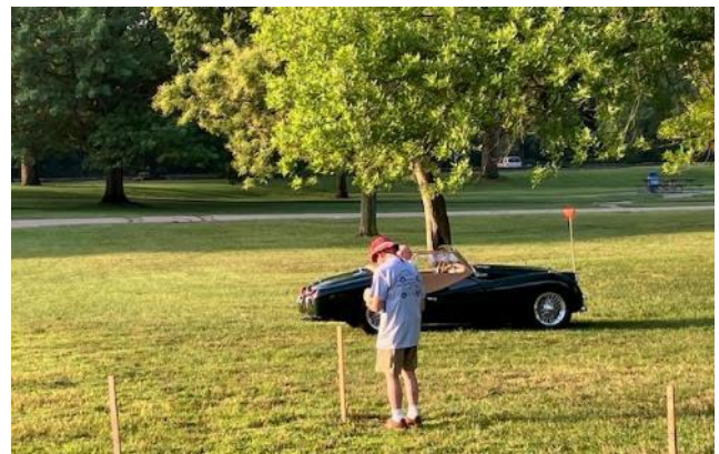
We did have a rare sighting of a Stan in the wild – we did manage to capture a few pics before he wandered off to set some signs...