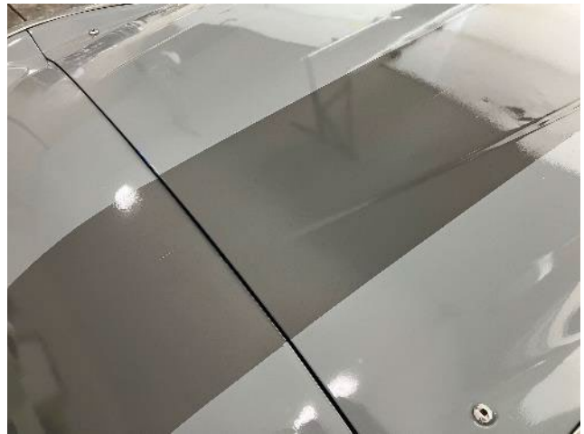
Front stripe on TGG

The front stripe is noticeably darker than the rear. Hmm, that means the base coats were different between cans with identical paint codes. Nice.