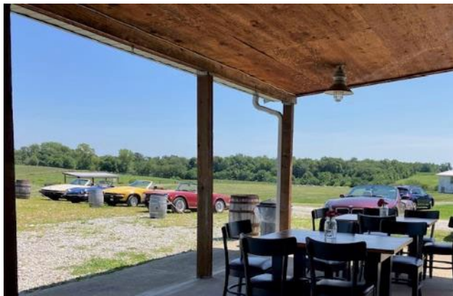
The LBC view from CCW outside area

Once we devoured the ice cream, we headed towards Caesars Creek Winery by roads less traveled up and down the Little Miami River Valley until we crossed the Caesars Creek and pulled into the winery. The Little Miami Valley has some great roads and elevation changes, so if you've not made a run with us, you should!