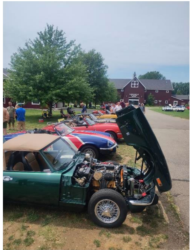
Spits at the show

We left the show at 4:00 and decided to totally avoid the interstate which cost us about 20 minutes but definitely worth it. Since there is no direct route from there to here, Google Maps had us make at least 50 turns on nearly as many roads. Rarely on a road for more than 15 miles. The plan was to make a quick stop at the Satek Winery near Angola where we arrived 25 minutes before they closed at 6. The free tasting of four wines by the four of us resulted in 5 or 6 bottles coming home with us. Yes, they were that good.