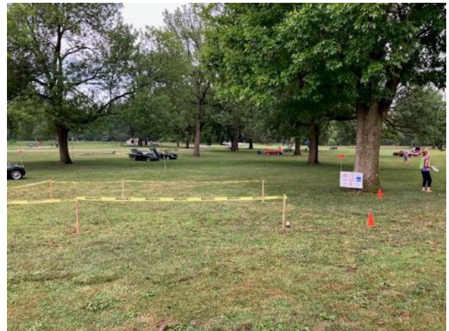
Not many cars at 7:30am – but we did have a lot of MVT members helping to set up registration. We have the lanes under construction and will work on the tent in a bit.