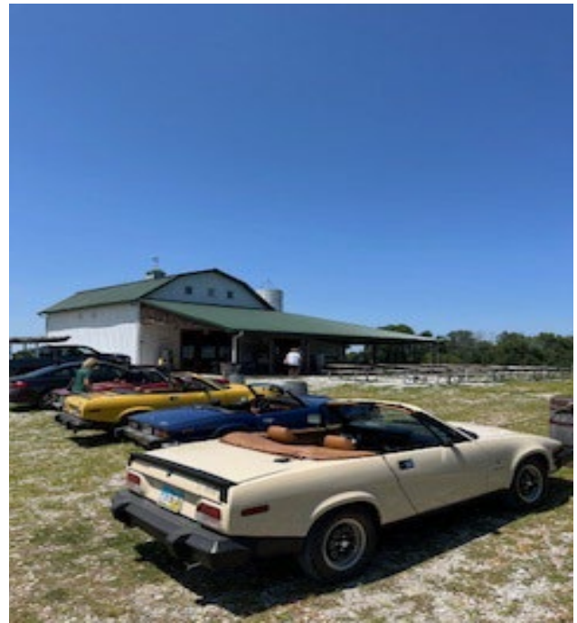
It was one of those days – blue skies above the winery