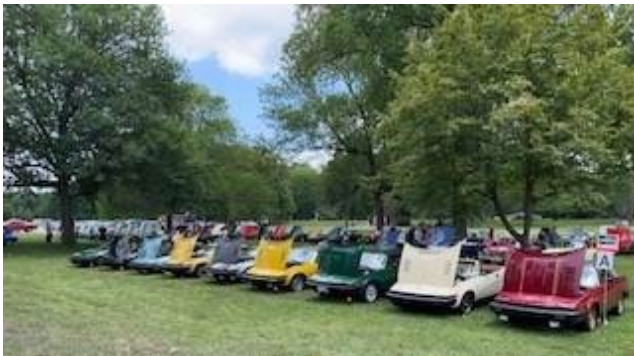
The Wedgemites under the trees – yes, the yellow FHC fourth from left is Yellow Jacket – it made it there under its own power, honest!