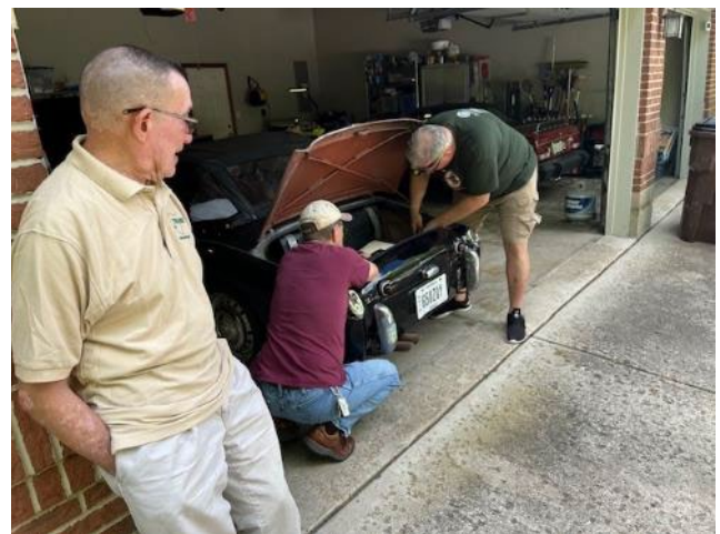
“Well, lookie there - they got the brake and tail lights working!”

The turn signals had us baffled, and we worked on them for quite a while, quite a while, but still they were not functional. More work is needed.