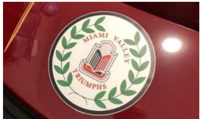
They look very spiffy on a TR7...