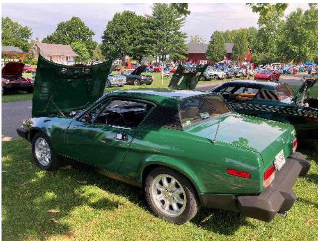
Hey, that car looks familiar....

We were able to claim TR parking spots under a very large Sycamore TRee. The shade was very much appreciated later! Cars continued to arrive all the way up to the noon cut-off and peaked somewhere a bit over 300. The Jaguar E type was the marquee and they had 20 of them on the field! Fabulous cars! The other British cars ranged from Aston Martins, Auston-Healeys, a DeLorean, Jaguars, a Jenson Interceptor, Lotus, Triumphs and of course lots of MG’s.