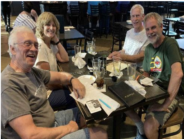
After dinner – boy, they all look so happy – how many beers did they have?

Overnight the predicted rain came through about 3 am and we woke up to our cars nicely “rinsed off”. After wiping them down, we arrived back at the Gilmore about 9:30 where there were about 80 cars on the field so far.