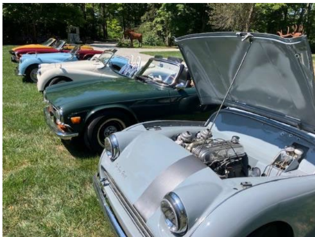
Pretties all in a row