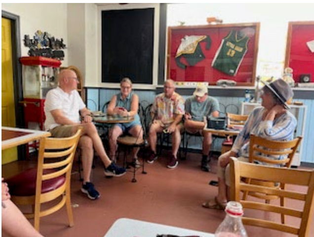
Ice Cream shop in Morrow - yum