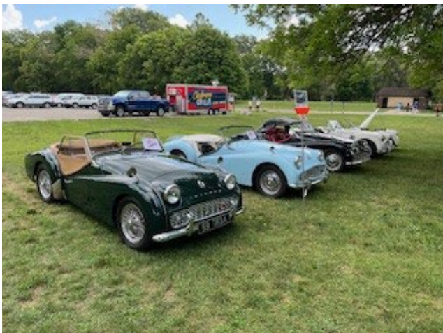
The stable of sidescreen TRs at BCD – down quite a bit this year, and all of them were MVT cars!

Congratulations to all the MVT winners! The MVT Winners this year were: