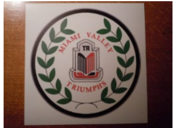
MVT Magnetic Signs – these can be easily cut so they are round. They are 12”x12”, 11” in diameter if cut round. - $12