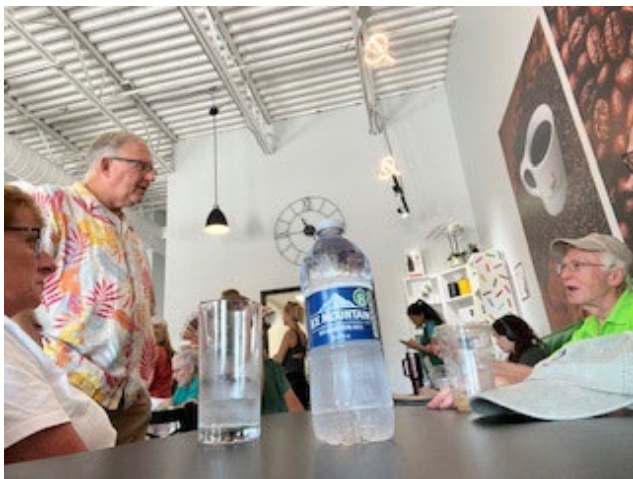
Discussing the fine points of hot coffee on a 90F day...

I also got to ride along with American Airlines for a business trip to El Paso, Texas, where I did see a canary yellow TR6 sitting in the parking lot of a restaurant and a Spitfire Mark II or III at a garage, needing some TLC.