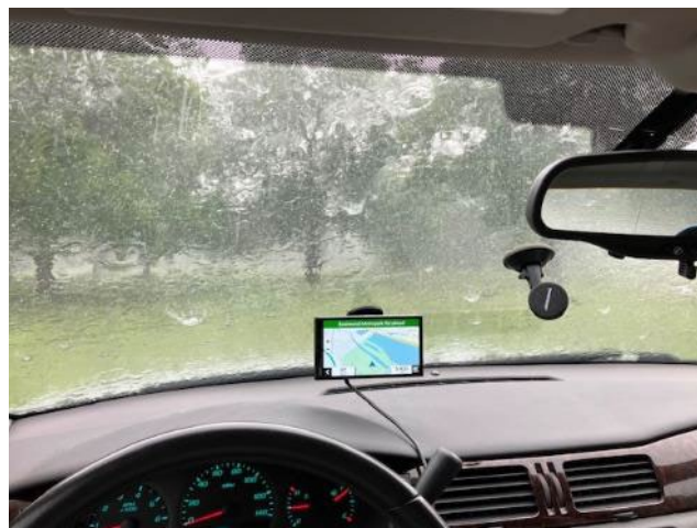
The rain in Spain falls mainly in Ohio

We always show up to Eastwood Metropark at 6PM the day before BCD to set up registration bags and parking. I've never seen it do a tropical deluge while we were trying to do it, but there is always a first time. Boy was it coming down – we just stayed park in the Chevy until it let up in about 15 minutes. By the time those of us waiting in the cars got into the shelter, Harry (who was there before the rain) had all the registration materials set up for packing. We then set about packing 300 bags with goodies and sorting them such that they can be easily found and handed out on the morrow.