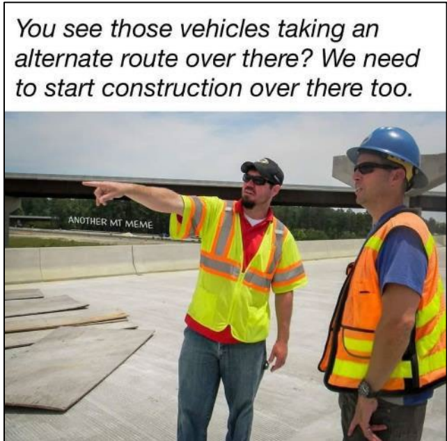
You see those vehicles taking an alternate route over there? We need to start construction over there too.