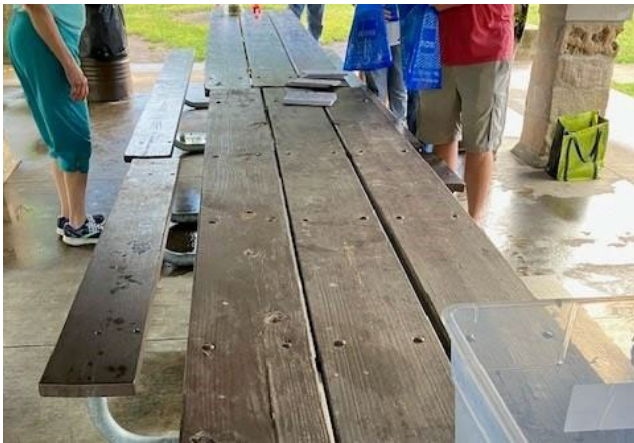
Table all empty – all bags were packed!

Thanks to all who came to help pack bags – there were a lot of you! Also thanks to the Meades who took me out for a birthday drink afterwards – much appreciated!