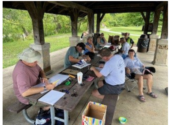
The counting crew hard at work on the ballots – thanks to all who volunteered!