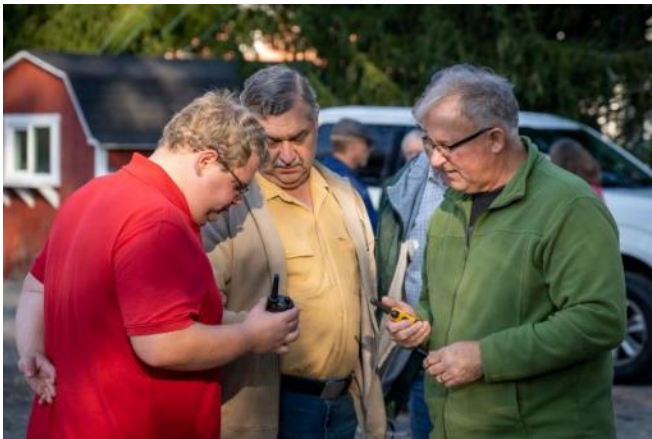
I think we spent a good 10 minutes trying to get all the radios to work - remarkable how many functions can be crammed into so few buttons