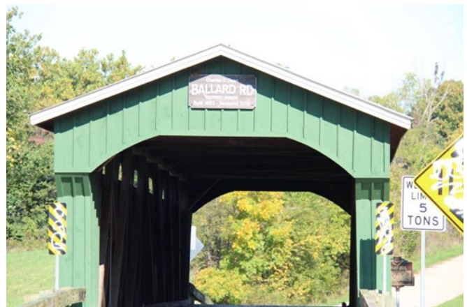
Ballard Road Bridge