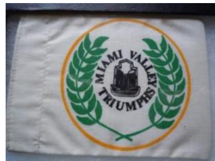
MVT Car Flag - $5.00