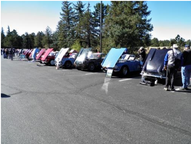
Triumphfest Car Show

The event consists of various drives, the Autocross and the car show itself. There were about 125 Triumphs there from CA, UT, CO, TX, Nm as well as AZ. Next year the show is in San Diego.