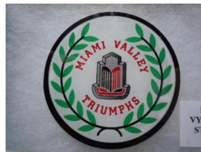
MVT Window Sticker - $1.00