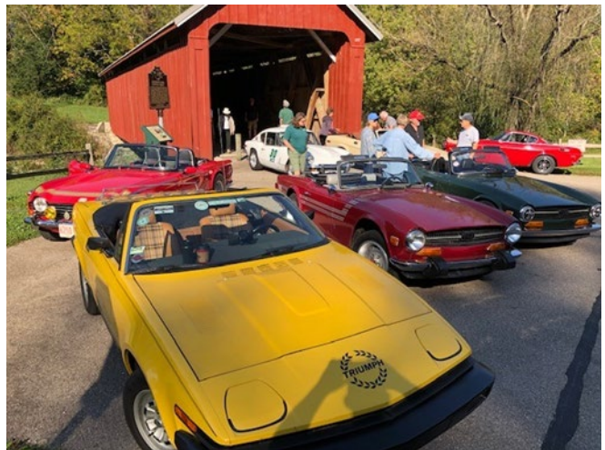
Stevenson Road Bridge

It was moderately cool, but a clear sunny day as we pulled out headed West initially and then transferring to the back roads out of Cedarville to the first bridge, Stevenson Bridge. Which is no longer used, but you can see out its back door how the roadway came down the hill to that entrance back in the day. Now the roadway has been curved to a modern bridge structure in parallel to the refurbished covered bridge.