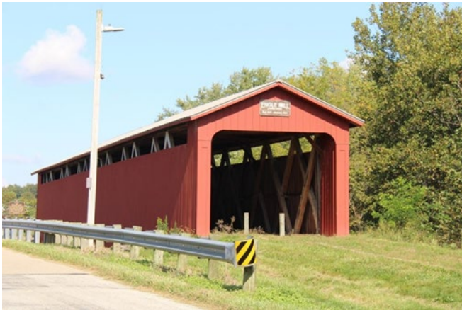
Engle Mill Bridge

Five cars headed on out toward Spring Valley and the bridge on Engle Mill road. There we found Motorcycles! 38, count'em! And 60 odd riders, including the three we had seen at Charleton and Ballard Bridges. The Engle Mill bridge was another which is set by the side of the road which had been moved over in favor of a reconstructed modern bridge and fully paved roadway. We stayed briefly and then set sail for the last bridge on the tour.