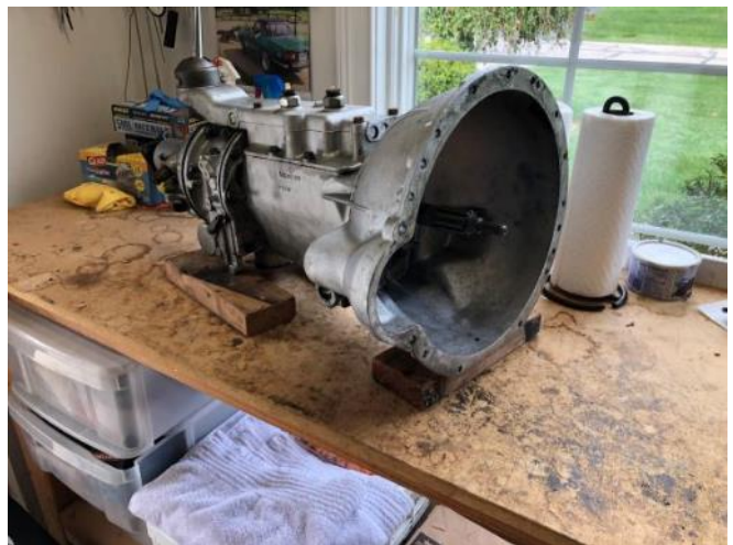
It's been benched

The transmission was moved to the workbench and the nosepiece containing the seal removed. There was nothing obvious with the seal or the shaft.