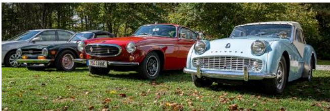
Next stop was supposed to be an antique/salvage shop in Spring Valley, but they had closed for the day, so we moved on to Waynesville and the Secret Garden where we parked around back.