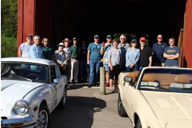
The Tour Team

about 25 minutes, most of the club standing around and talking, with the ladies here and the guys, there.