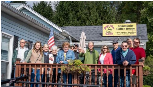
Potty and coffee stop at the BellHOP in Bellbrook where we took the obligatory group photo