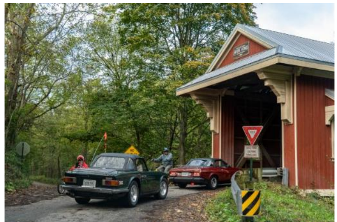
On the way back down the Little Miami we visited a covered bridge in Yellow Springs