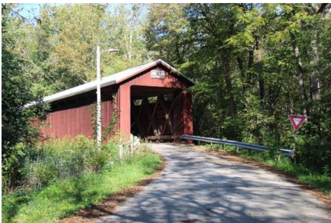
Charleton Mill Bridge

Then it was on to the third bridge, again a short distance away. We crossed Rte. 42 and came up to old Rte. 35, and a strange road intersection with a two way stop. One for us and a stop sign for a road coming from the left (which crossed our road). There was also a stop sign beyond our stop sign. It was a short (20 feet??) straight section, at Rte. 35 where we make a left turn.