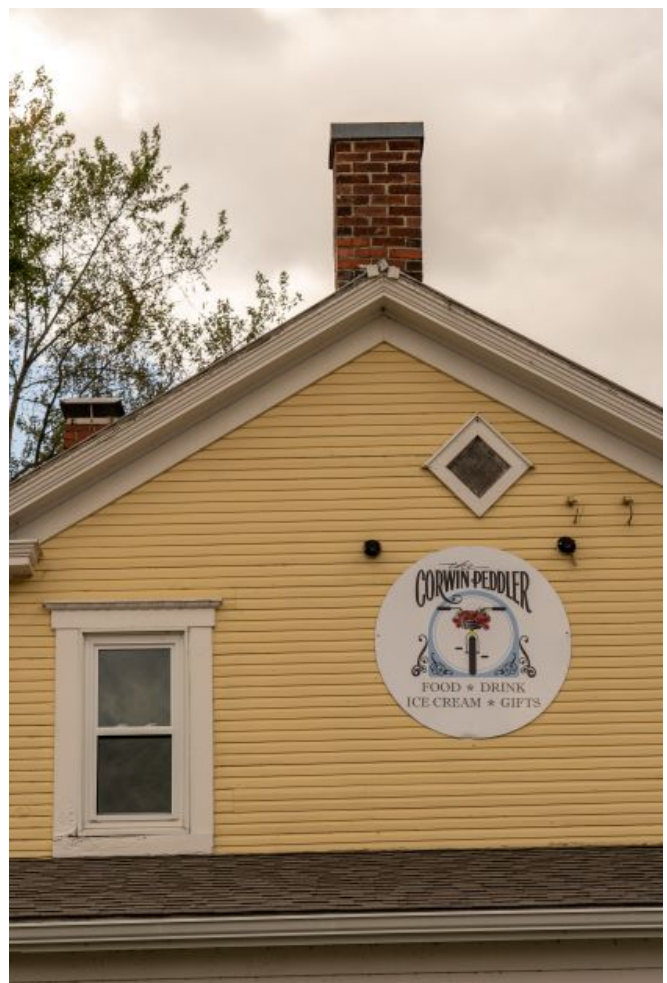
After Waynesville we jumped the Little Miami into Corwin to visit the Corwin Peddler - an on-again, off-again café on the bike path. Today they were open and in full swing...