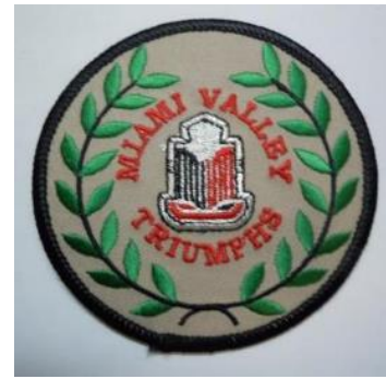
MVT Cloth Patch - $12.00