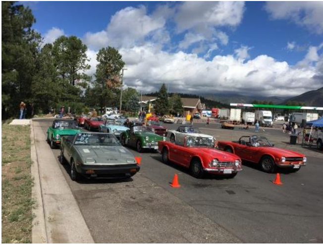
Triumphfest Autocross Staging Area

The event consists of various drives, the Autocross and the car show itself. There were about 125 Triumphs there from CA, UT, CO, TX, Nm as well as AZ. Next year the show is in San Diego.