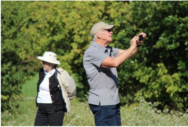
<Caption this yourselves>

Five cars headed on out toward Spring Valley and the bridge on Engle Mill road. There we found Motorcycles! 38, count'em! And 60 odd riders, including the three we had seen at Charleton and Ballard Bridges. The Engle Mill bridge was another which is set by the side of the road which had been moved over in favor of a reconstructed modern bridge and fully paved roadway. We stayed briefly and then set sail for the last bridge on the tour.