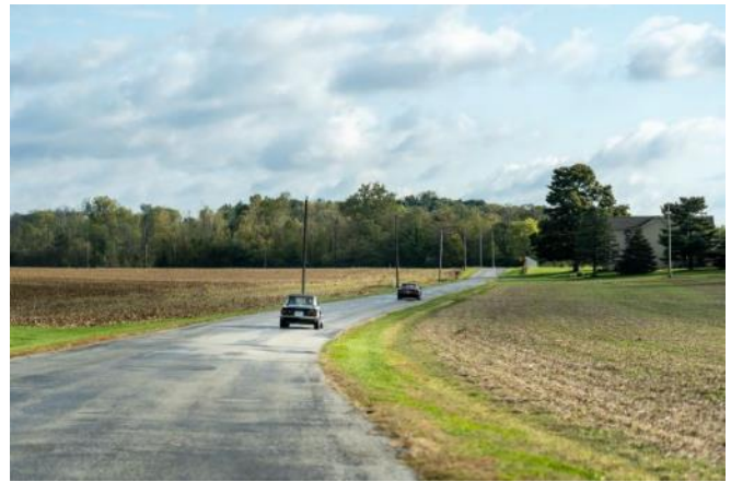
The first part of the drive was actually to the northeast around where several creeks come together to form the Little Miami. The day had started overcast, but the sun was breaking through by now.