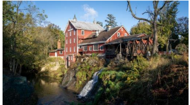
The mill in morning splendor

becomes a gorge, before that the valley is really not very distinct, which makes sense since you are at the headwaters.