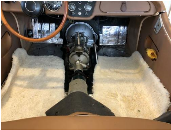
Ready to pull

Saturday turned out to be a nice but cool day. Coffee and donuts were ready and people started showing up. Chuck and Bruce showed up first followed by Stan and Jeff. A bit later Brian Sullivan showed up in his blue GT6. It did not take long to remove the remaining transmission to engine bolts, jack up the back of the engine, and start to remove the transmission. A pause was taken to completely remove the rear transmission mount plate and the transmission came out without too much trouble.