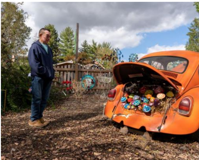
Stan contemplates turning the R32 into a planter