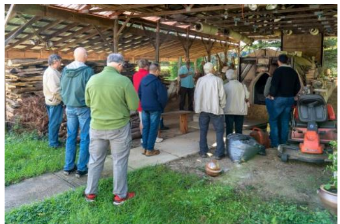
Visiting Miami Valley Pottery we got a tour including the kiln where all of the pottery received it's final, major firing