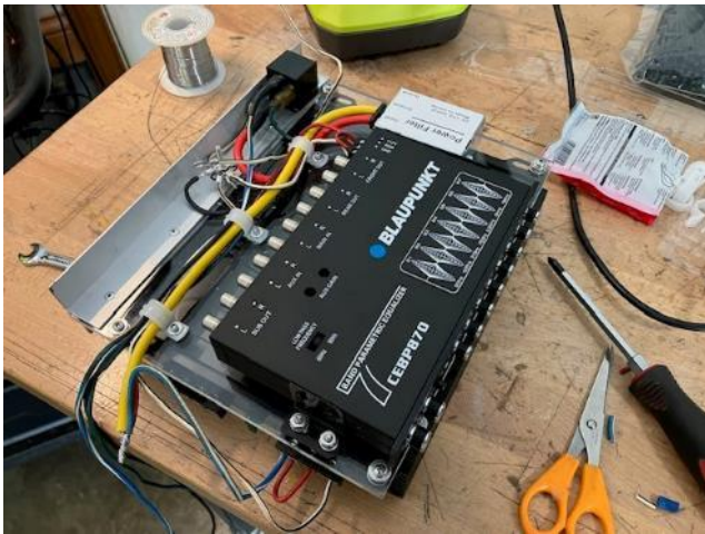
Partway in the construction process – here is the pre-amp, power filter, and power relay on one side of the acrylic sheet, power amp is on the other side

Decided to mount these vertically across from each other on an acrylic plastic substrate. I just happened to have a couple of available trunk holes left over from the last battery hold-down bracket. I would need to make a harness, and also relay switching these as well as running a separate, fused power line. I was up to the task.