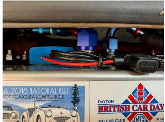
Bluetooth receiver mounted on top the fuel cell

making up a new power lead for the module that goes straight to the battery. Again, nothing hard, but since it's detail work it takes a little time.