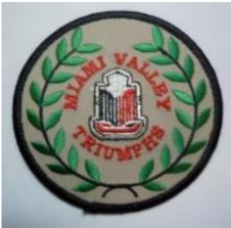
MVT Cloth Patch - $12.00