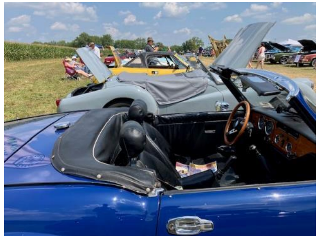
The line of MVT'ers – maybe a dozen showed up? I lost count – it was a long line of British cars...

The caravan left Panera and had an uneventful drive to Young's Dairy where we paid our $5, parked out cars, and got our windshield car details plaque. Next, popped out hoods and set up chairs and started talking cars with folks wandering by.