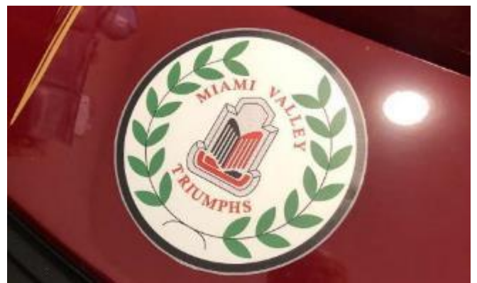
They look very spiffy on a TR7...