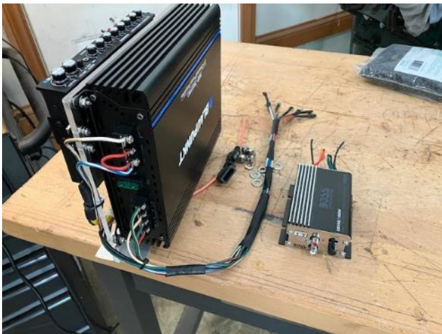
Comparison of the completed new pre-amp/amp module (left) and the old one (right). Go big or go home...

It was a straight-forward build. It took a long time to do the detail work of wiring, soldering, and insulation, but it was worth it.