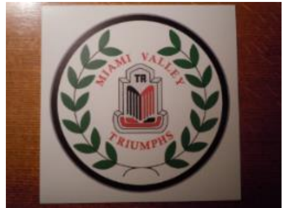
MVT Magnetic Signs – these can be easily cut so they are round. They are 12"x12", 11" in diameter if cut round. - $12