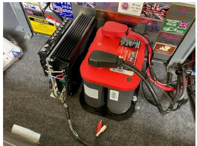
Module in place in trunk. Good thing I don't store anything here except tools...

Fired right up when I turned it on – much better Bluetooth gain without noise.