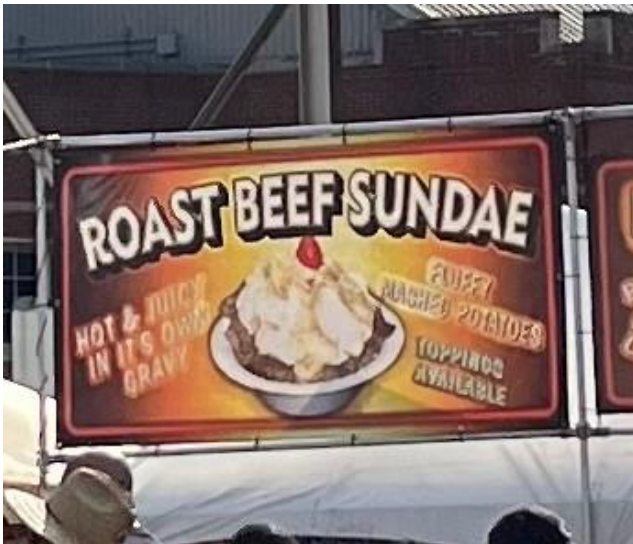
One of the four food groups