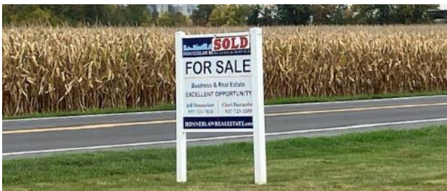
Sadly, Windy Acres is closed...

C'mon down and get your pumpkins and mums on! We will start off from Winans Coffee and Chocolate - 4425 Feedwire Rd, Dayton, OH 45440, at 10AM and then wander about the Little Miami River watershed looking for pumpkins, weird shaped squashes, and snacks. Oh, mums, there are mums.