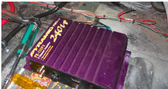
Pyramid amp back in 2011 when I was making the mounts for it in the trunk of The Grey Ghost

When I first put The Grey Ghost together for the second time in over twenty years back in 2012 (long story), I wanted a sound system in it. I am an extravert, I need noise, I want music. I had an amp out of The FrankenStag, several MP3 players, and a RetroAudio combined stereo 6x9 speaker. That is all you need. The amp itself was built into the trunk – a Pyramid unit that was way-over optimistically rated at 240 Watts (probably about 20W/channel on a good day). I think I paid $20 for it back in 2005 at a garage sale. It worked okay.