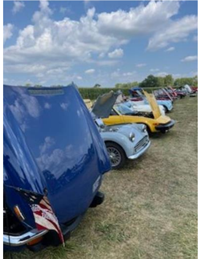
Bob Pool Orphan Auto Show – hot, but good

though to enjoy your rides, the start of Autumn always provides great days during the weekdays to drive to work, the grocery store, or just to enjoy the experience of wind in your hair