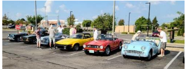
MVT gets their bread on!

(John's write up of that experience follows this short show recap – Ed)