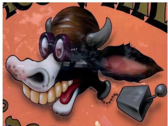
Not sure what this is, but I bet there is food involved – Ed

Don't forget the monthly meeting Wednesday September 4 th , 6:30 to eat and 7:30 for the meeting. See you there.