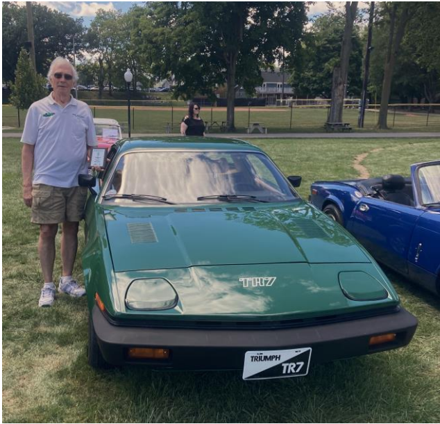
Another day, another trophy...