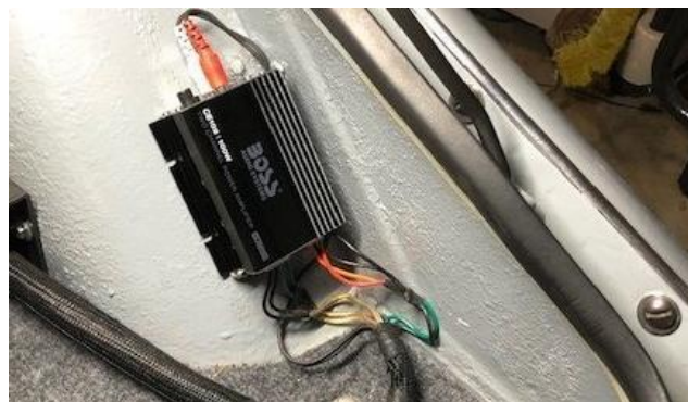
The Boss amp in use from 2020 to 2024

Needed a cheap amp to fill in, and Amazon came to my rescue with a 100W/Channel (more like 20 maybe on a good day) amp from Boss. $25 from Amazon. Several years later I added a Bluetooth receiver since I was using the phone by then and not an MP3 player.